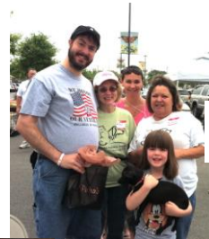
2,500 th adoption at an AAPAW Event